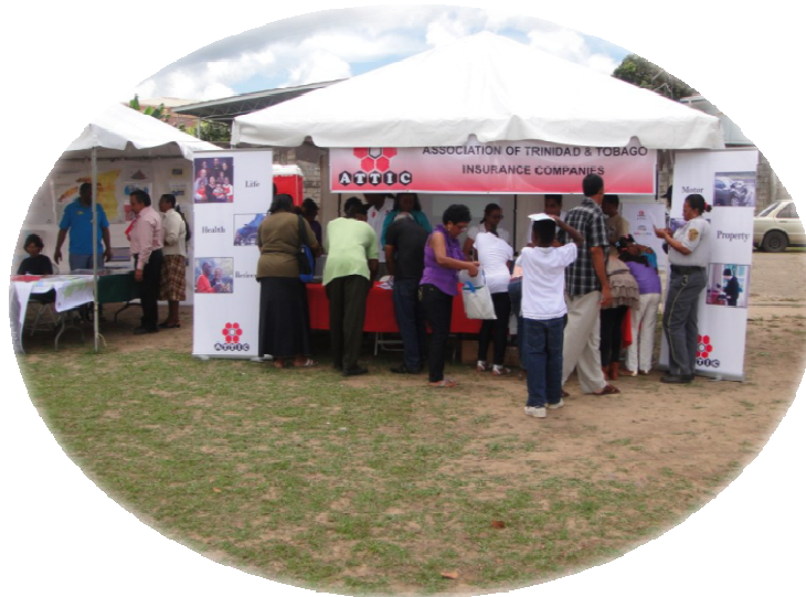
ATTIC's Booth at the NFLP's Exposition in Siparia