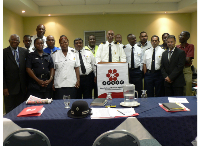
Licensing Officers at the Motor Vehicles (Third Party Risks) Act Workshop.