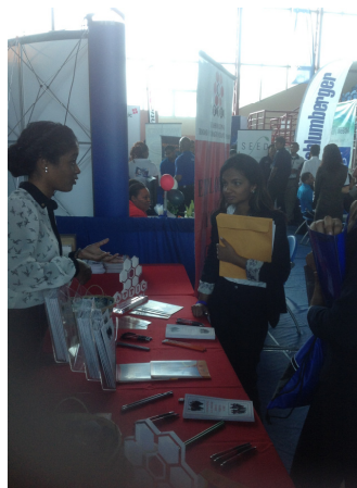
ATTIC's Research Assistant chats with students at UWI's World of Work

On March 21 st ATTIC participated in the University of the West Indies World of Work. Apart from promoting the insurance industry as a viable career option to approximately 100 students we were able to collect resumes from students. Please contact us if you do need resumes for any vacancies.